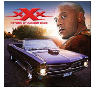
VIN DIESEL'S 1967 'XX' GTO FLAME CAR

ALL PONTIAC & GMC TRUCK DAY 2017 Look for these featured vehicles and others!