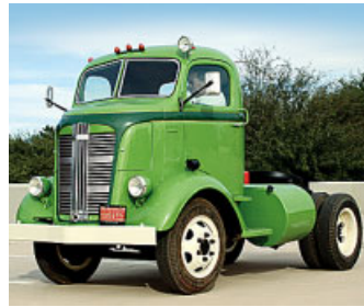
JOHN WAZORICK'S 'Lucky #7' 1937 GMC C.O.E.