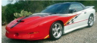
LES JARVIS' 1996 WS-6 TRANS AM CUSTOM