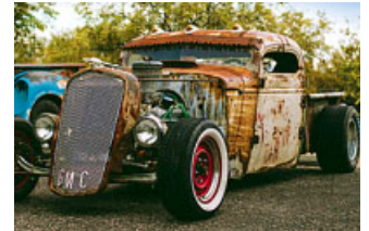
ANDY SPEER'S 1939 GMC RAT ROD