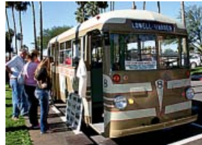
OLD PUEBLO TROLLEY'S GMC/YELLOW #8

Tucson event to be held Rain or Shine • Public Welcomed • No Cost to Participate *advertised features subject to availability