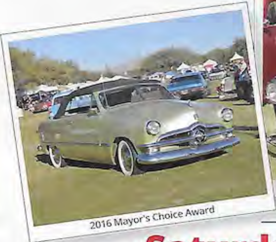
2016 Mayor's Choice Award