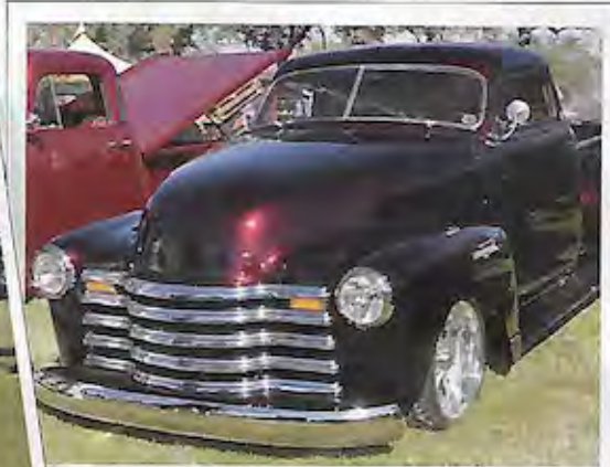
2016 Best In Show